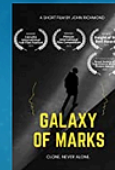
Galaxy of Marks