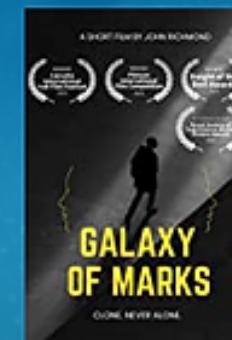
Galaxy of Marks